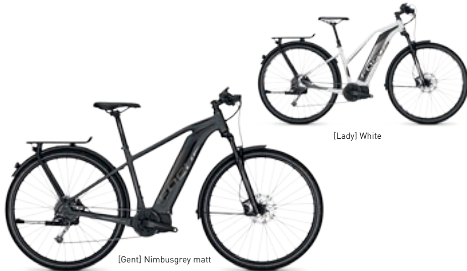
[Gent] Nimbusgrey matt