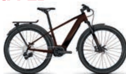
[2] Havannabrown matt