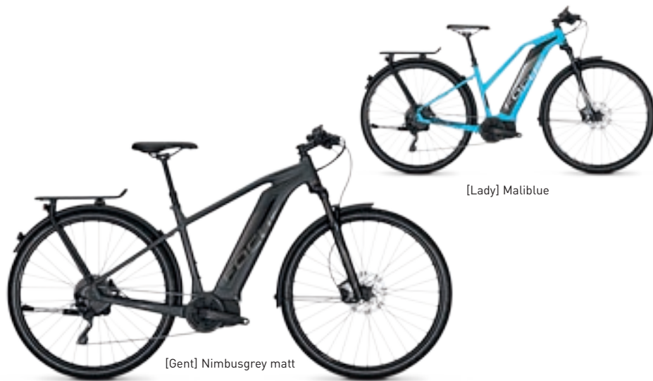
[Gent] Nimbusgrey matt